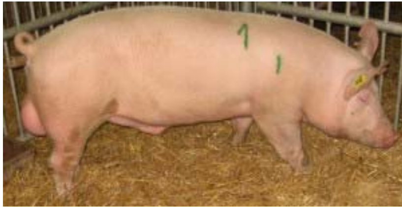
Obrázok 4 Plemeno Biela ušľachtilá