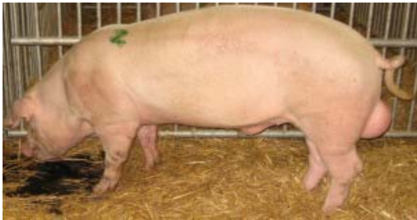
Obrázok 5 Plemeno Landras domáci