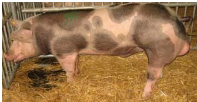
Obrázok 6 Plemeno Pietrain